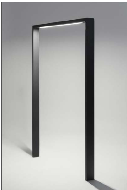
Registered design N° 20 2017 105 513.