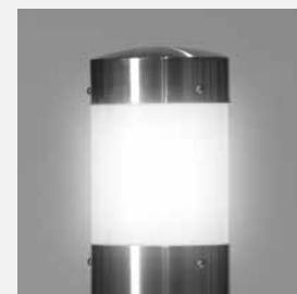
Stainless steel, satined acryl glass