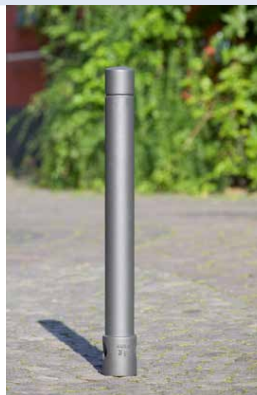
Colour: DB 703, Design: "hammer.runge design"