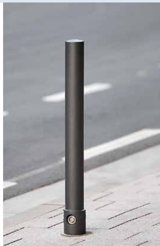
Colour: DB 703, Design: "hammer.runge design"