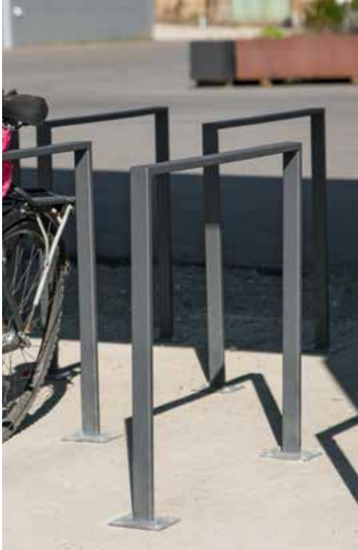
Colour: DB 703, version with flanges